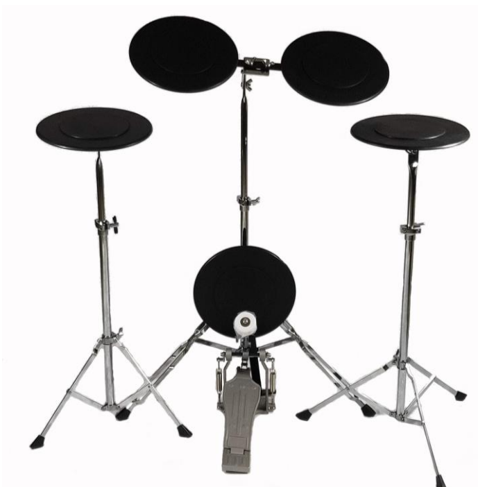
Assembled practice drum kit.

Step 5. Place stand 2 and stand 3 either side of stand 1. You may need to adjust the height and angle of pads for playing comfort.