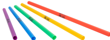
PP794 Bass chromatic set 5 sharps and flats (C#29, D#31, F#34, G#36, A#38) which combine with the PP793 to create a full chromatic octave of 12 notes. Tubes range in length from approx 27" to 48".