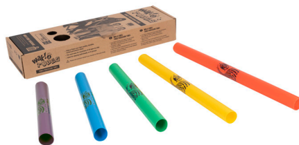
PP791 Chromatic set 5 sharps and flats (C#41, D#43, F#46, G#48, A#50) which combine with the PP790 to create a full chromatic octave of 12 notes. Tubes range in length from approx 12" to 24".