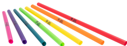
PP793 Bass diatonic set 7 notes: C28 to B39. Rich and sonorous, these combine nicely with PP790 to form 2 full octaves. Tubes range in length from approx 24" to 48".