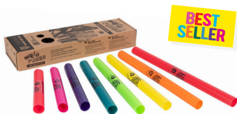
PP790 C Major diatonic scale set 8 notes C40-C52, ranging in length from 12" to 24".