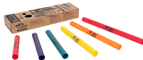
PP795 C Major pentatonic scale set 6 notes C40, D42, E44, G47, A49, C52. Suitable for younger players, as all the notes sound pleasing when played together. Tubes range in length from approx 12" to 24".