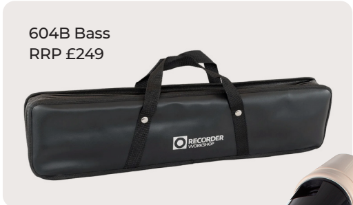
604B Bass RRP £249