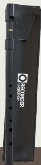
101F Fife RRP £7.99